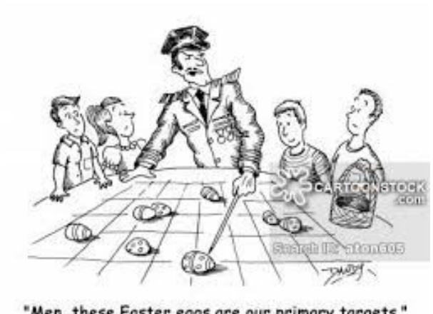
"Men, these Easter eggs are our primary targets."

According to the 2010 census, over 7000 veterans live in Putnam County.