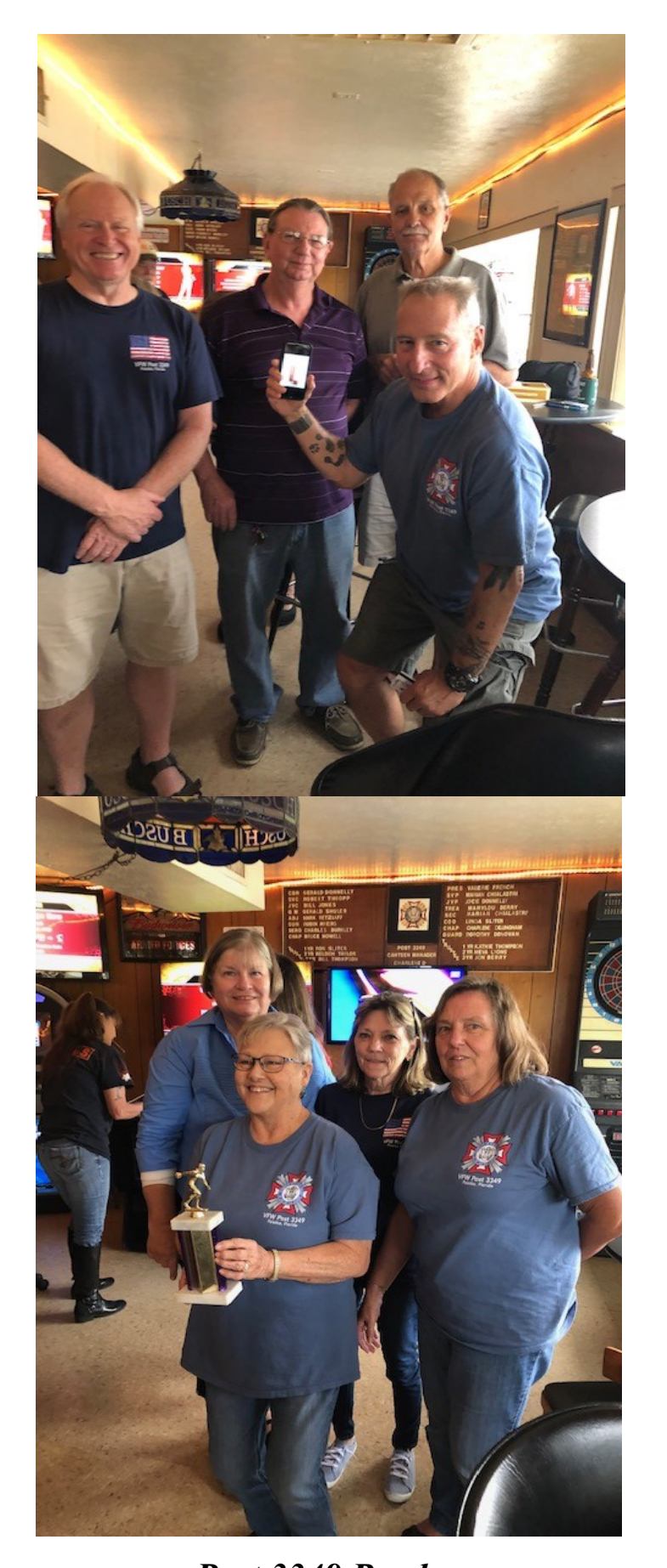
Post 3349 Bowlers