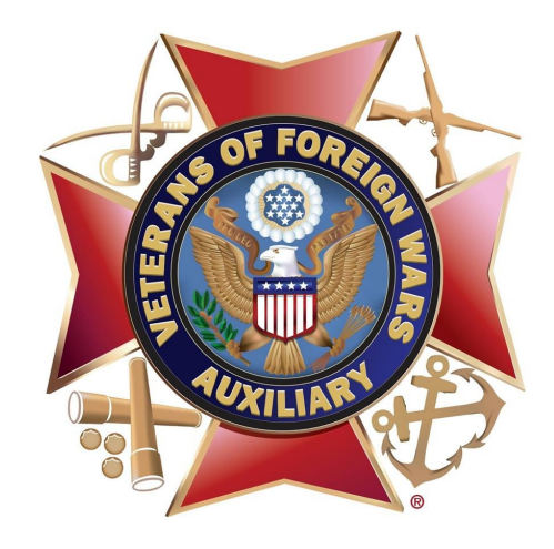
FROM THE COMMANDER December 2020

Our Veterans day rally at the riverfront went very well. We had at least 25 people walk the bridge and almost every car that passed waved or sounded their horn. It was very encouraging to see all the support from people passing by. Thanks to Bill and Gene for carrying the flags.