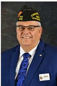
National Commander Hal Roesch

About the VFW: The Veterans of Foreign Wars of the U.S. is the nation's largest and oldest major war veterans organization. Founded in 1899, the congressionally chartered VFW is comprised entirely of eligible veterans and military service members from the active, Guard and Reserve forces. With more than 1.5 million VFW and Auxiliary members located in over 6,000 Posts worldwide, the nonprofit veterans service organization is proud to proclaim “NO ONE DOES MORE FOR VETERANS” than the VFW, which is dedicated to veterans’ service, legislative advocacy, a military and community service programs. For more information or to join, visit our website at vfw.org .